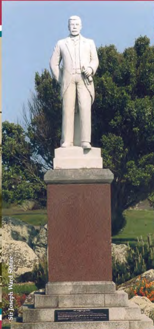
Sir Joseph Ward Statue